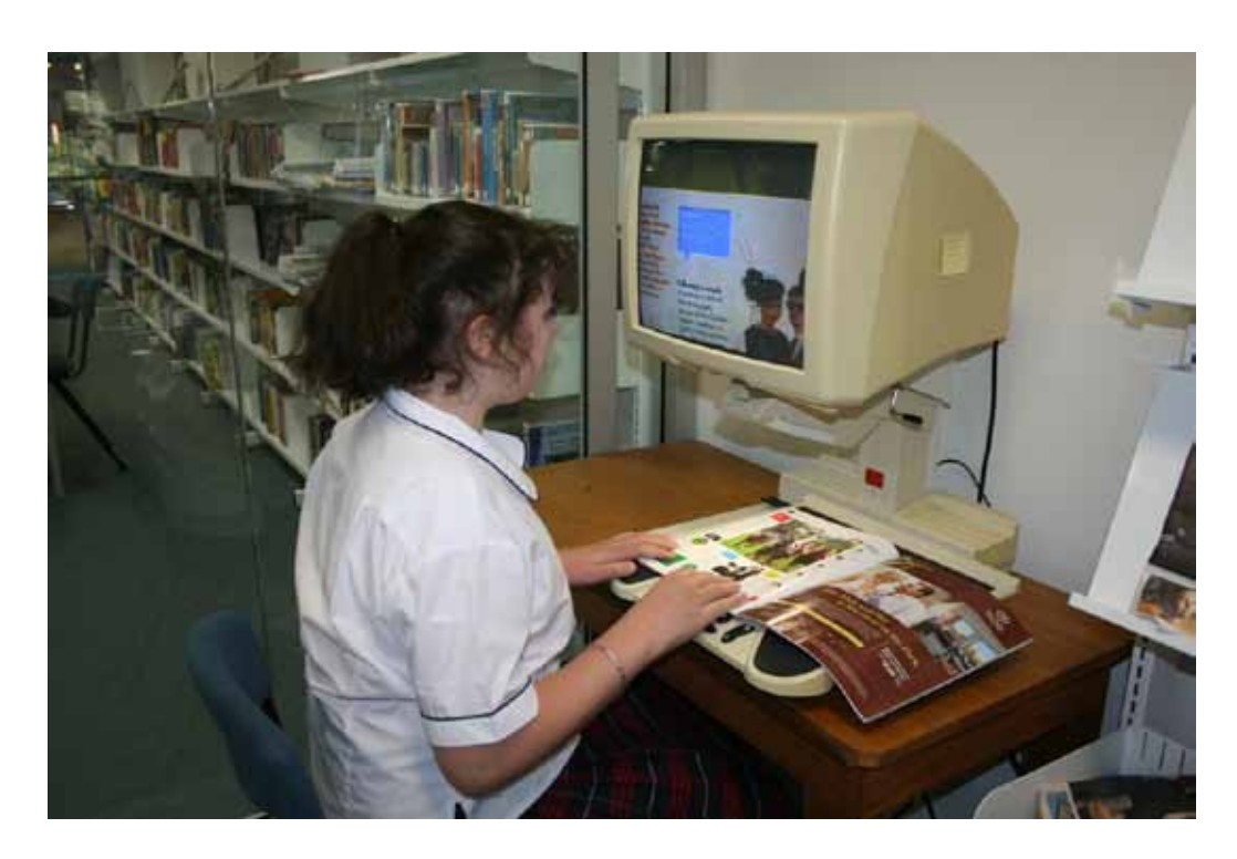
Electronic magnifiers limit the amount of the page visible at a time