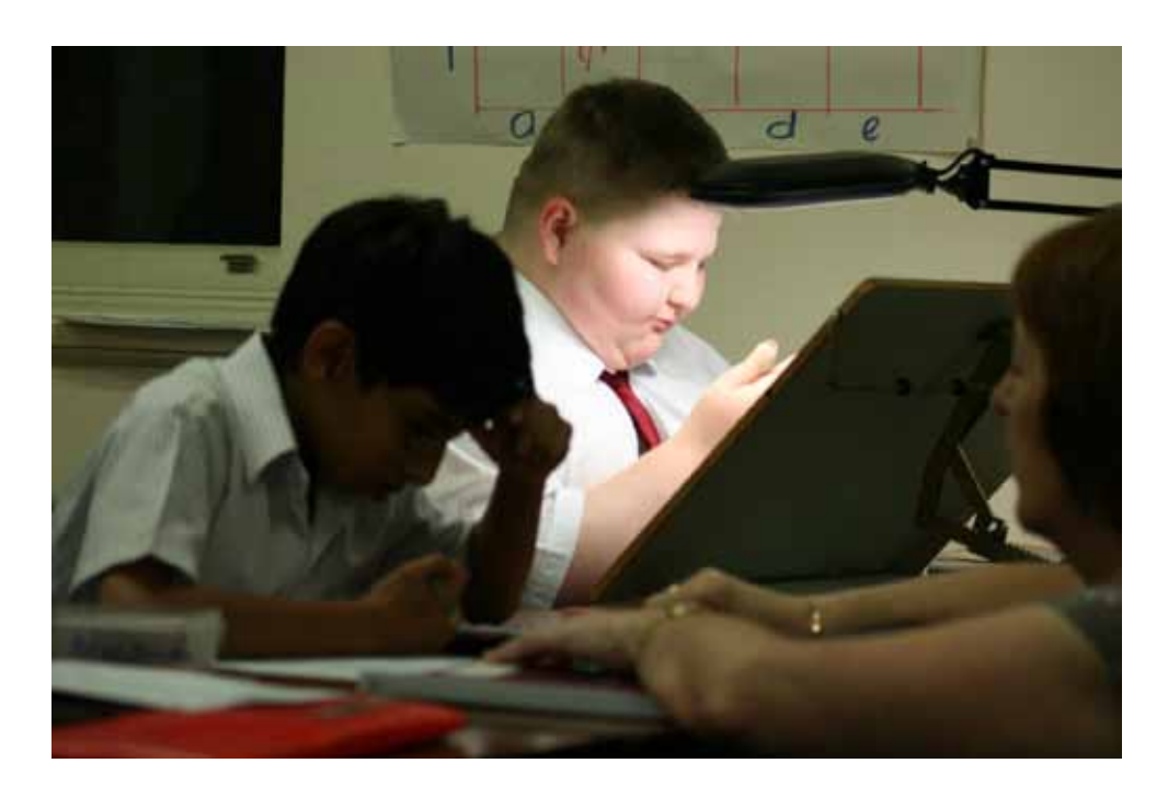
Some people rely on their remaining vision to read